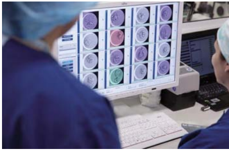
📷 IVF artificial intelligence system.

IVF Australia has fed one million time lapse photos of these developing embryos into a maxi computer and told it which ones led to a pregnancy and which ones did not.